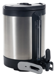
SH SERVER, 1.5G/5.7L INF SERIES